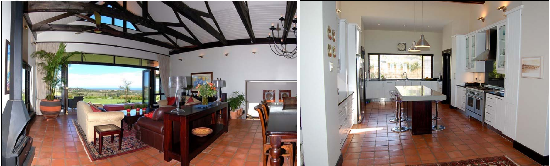
Examples taken from an existing dwelling